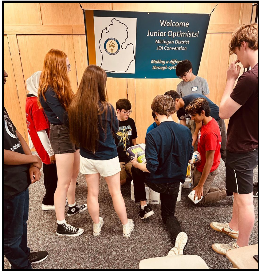
Group trying to build a tower of donated toilet paper