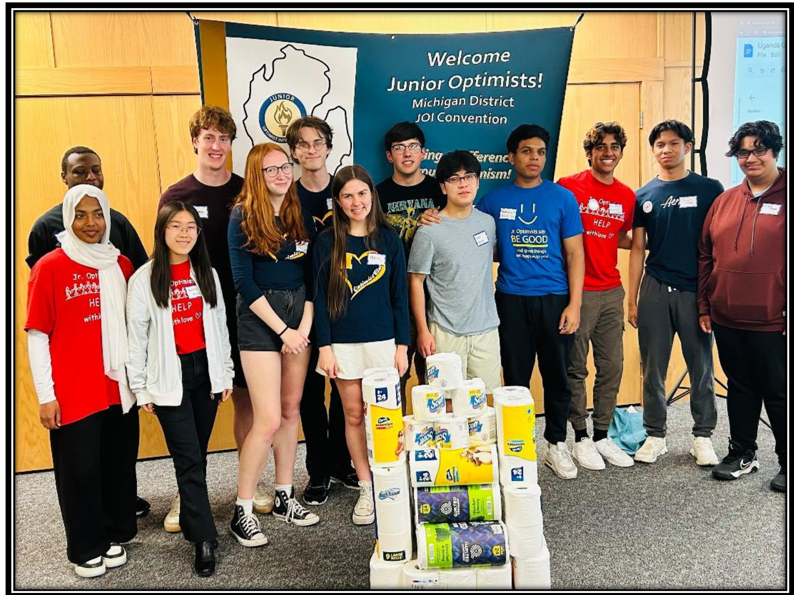
Success! Toilet paper donated to C.A.R.E.S. of FH who serve over 700 people