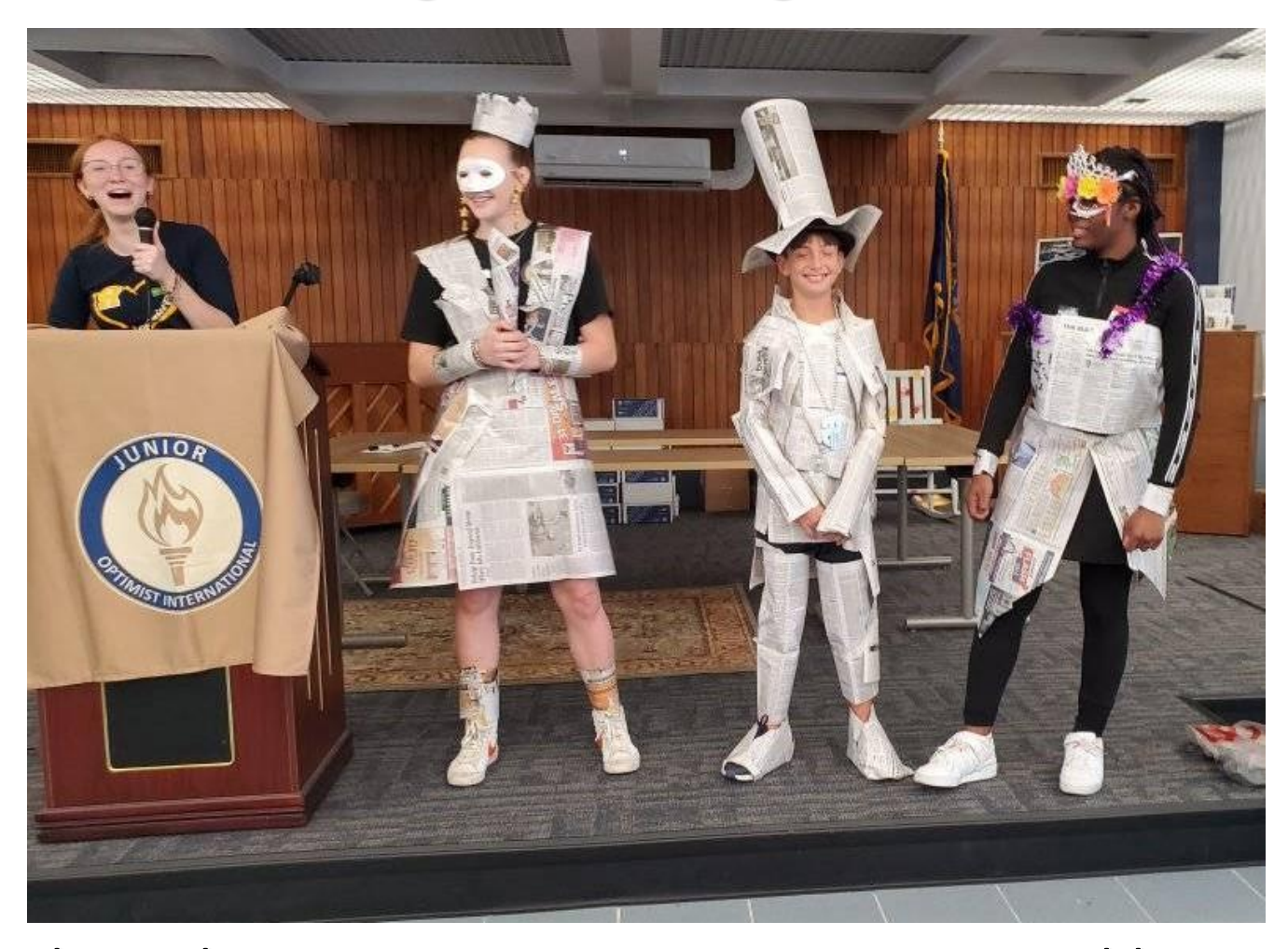
Fashion Show - turning newspapers into wearable attire