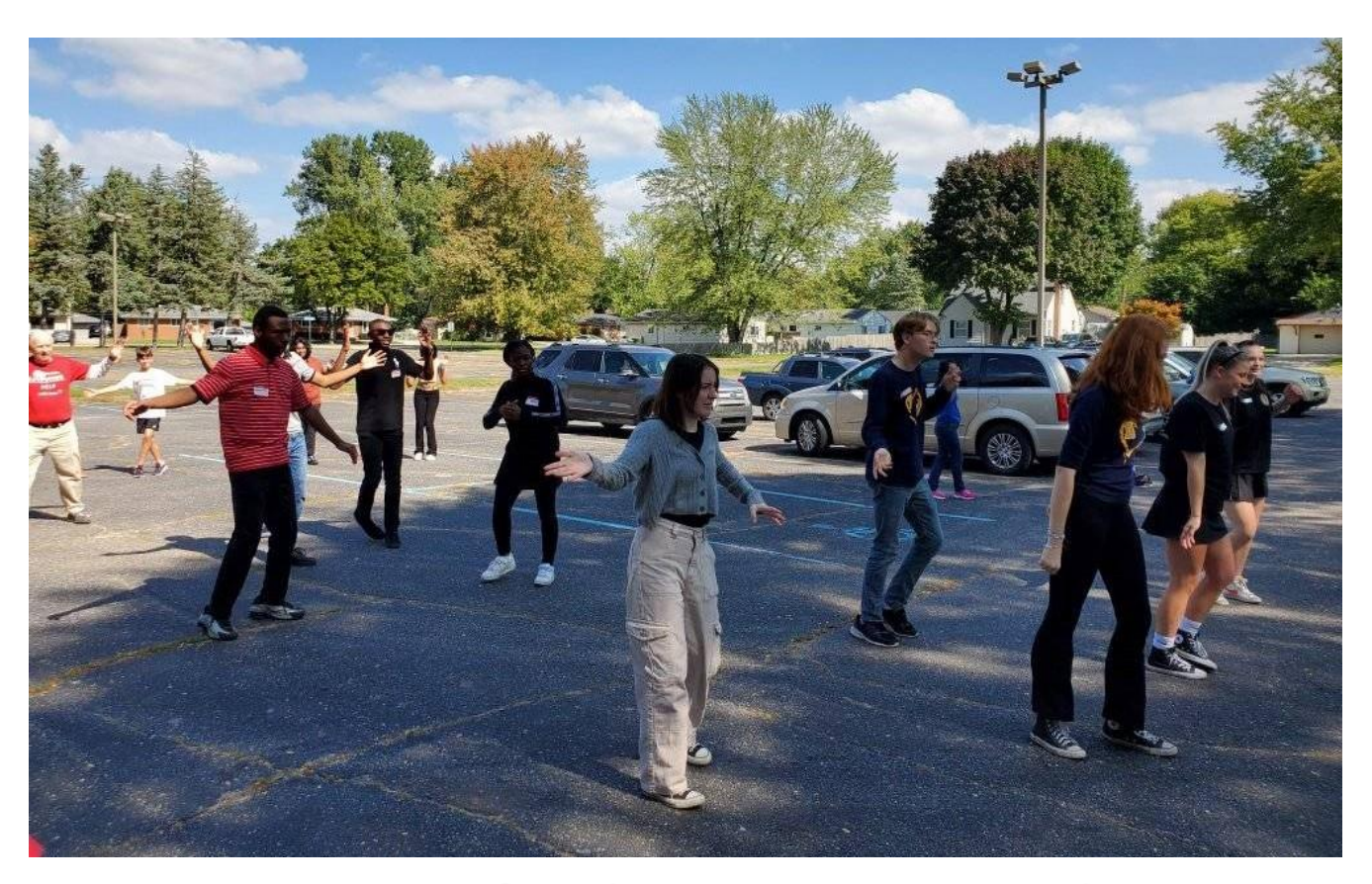
Having fun learning to Zumba