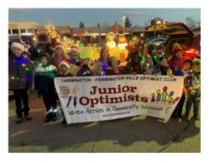
Meet in the parking lot of Greater Farmington Area Chamber of Commerce no later than 4:45pm. 32780 Grand River Ave.