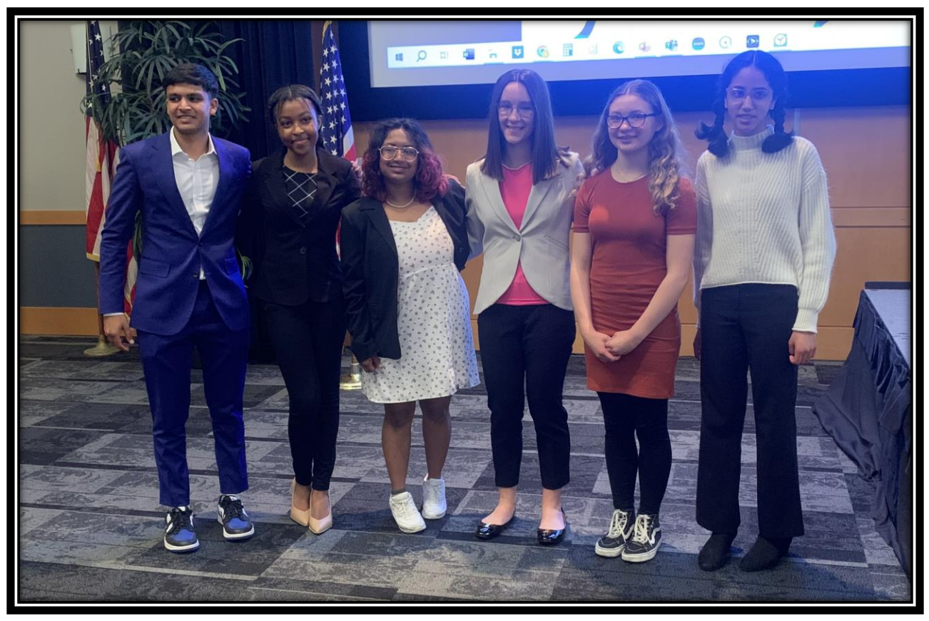
Winners in order, left to right, of 2023 Michigan District Oratorical