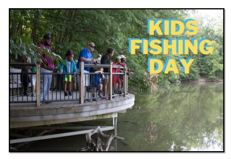
From Nature Center News via eblast