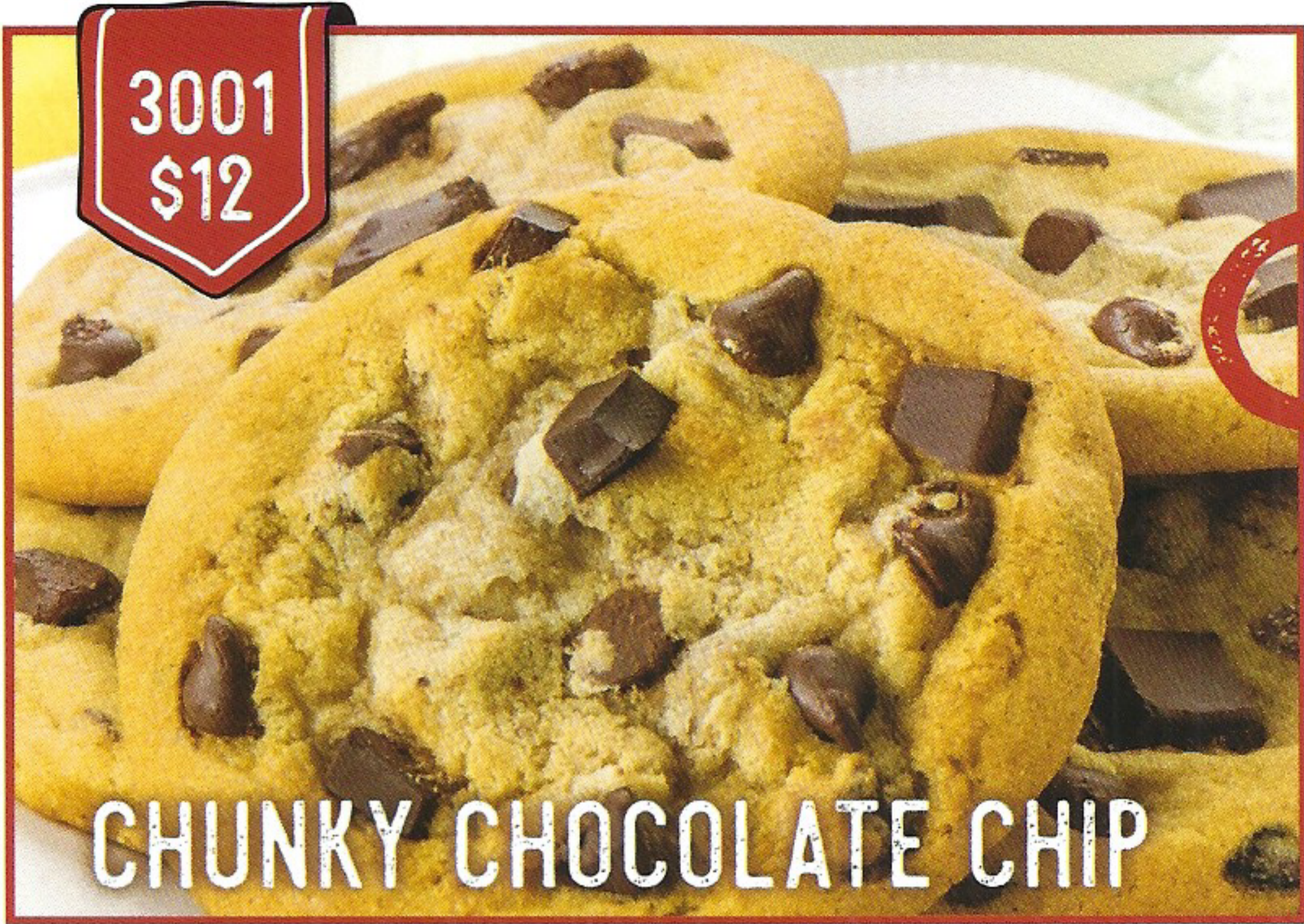
3001 $12 CHUNKY CHOCOLATE CHIP