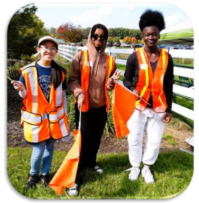
NFHS JOI students volunteered to work the MSU Tollgate Pumpkinfest helping with parking.