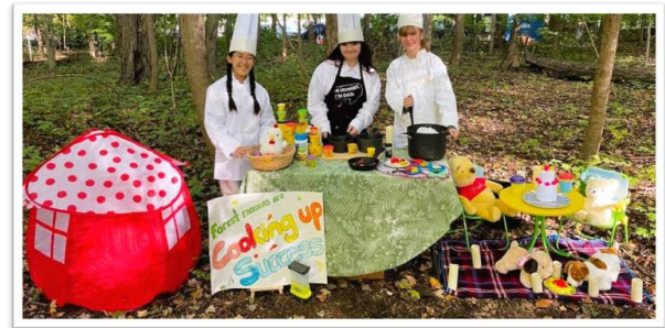
NFHS JOI students volunteered at the Forest Elementary Enchanted Forest decorating a booth to distribute candy.