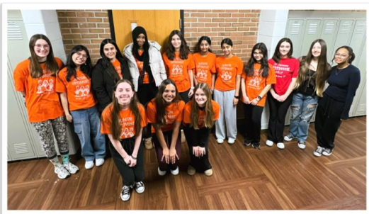
Farmington High Jr. Optimist Club