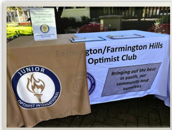
One of the ways we recruit teacher leaders for Jr. Optimist Clubs

Table at Farmington Public Schools "Welcome Back Picnic" for staff